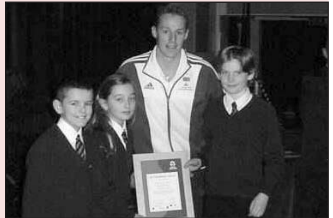
Pupils of St John's School receiving the Gold Award

Other activities last year included a very successful CD recording which included all the children; the cover and title were designed by children and boasts 27 tracks of singing and recorder playing. The recorder club has also maintained its strong links with the community and